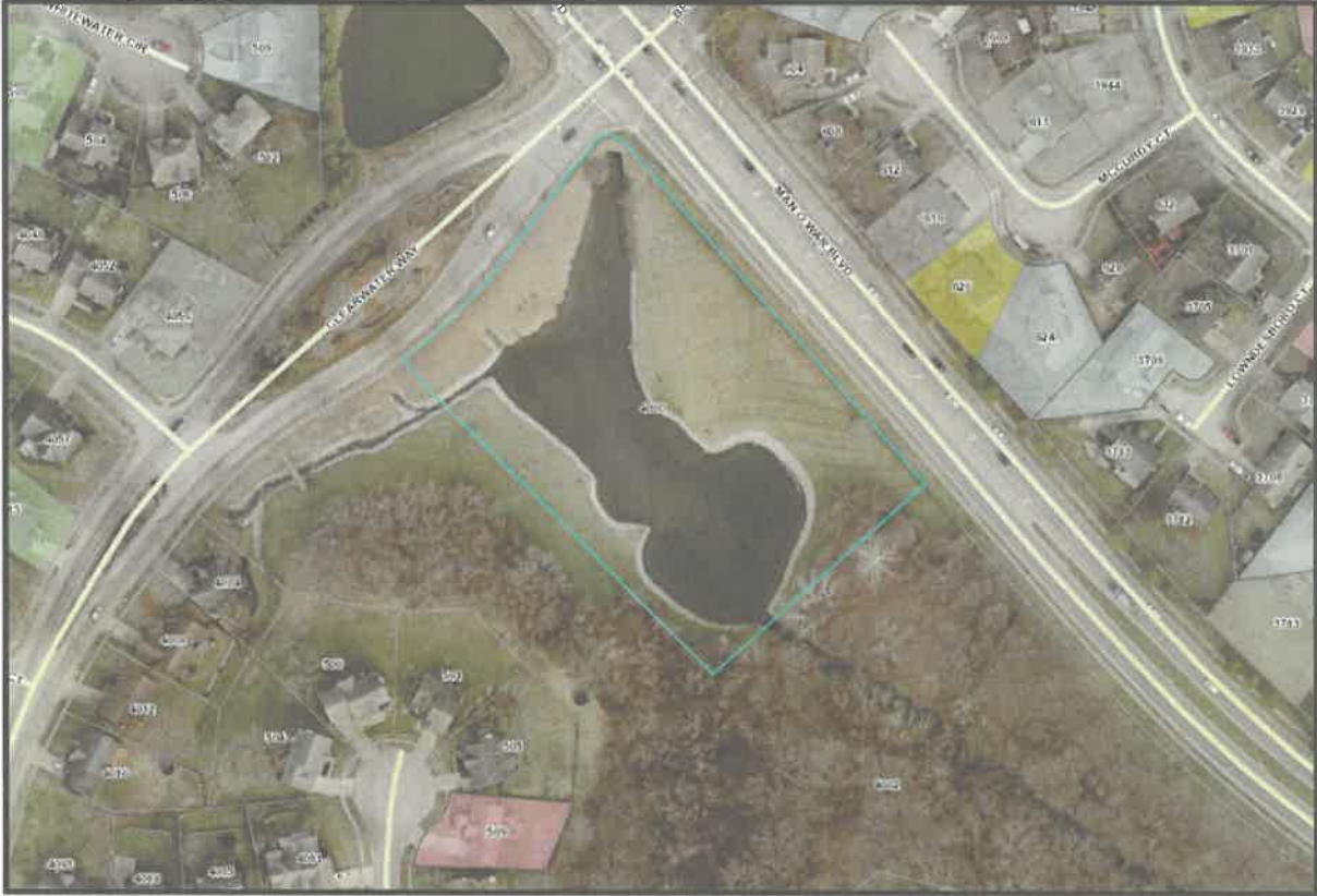
FIGURE 1 – MAP OF PROJECT AREA (FROM PROPERTY VALUATION ADMINISTRATOR)