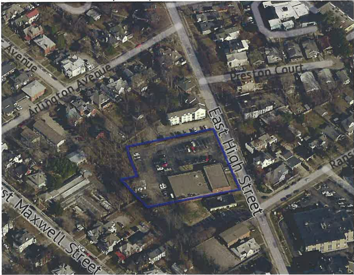
FIGURE 1 – MAP OF PROJECT AREA (FROM PVA)