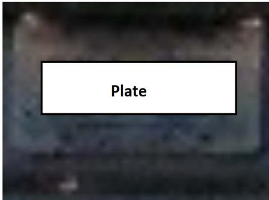
Plate KY Source NCIC Camera #07- @ Date 2/13/2023, 6:12:27 PM Topic Stolen Vehicle 3 days ago Description GLD HYUN SON Network Outbound Lexington KY PD