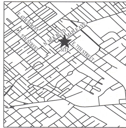
VICINITY MAP SCALE: NTS