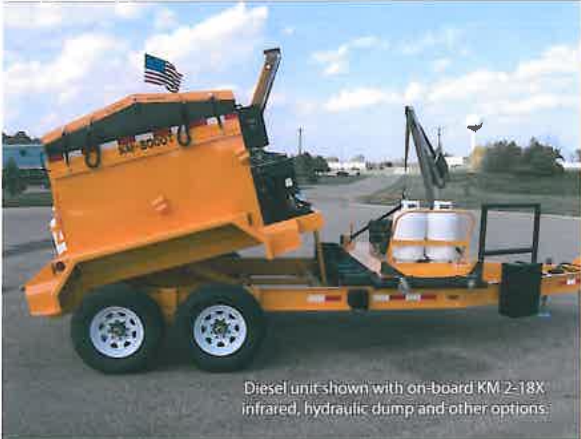
Diesel unit shown with on-board KM 2-18X infrared, hydraulic dump and other options.