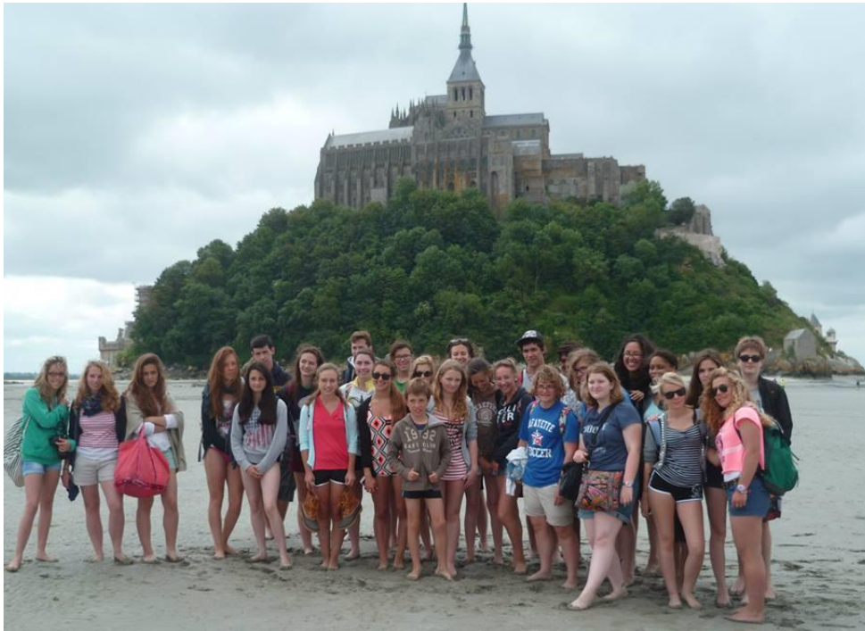
Students on the Deauville Exchange visit Mont St. Michel.

• 28 students from our sister cities visited Lexington as part of the student exchange programs.