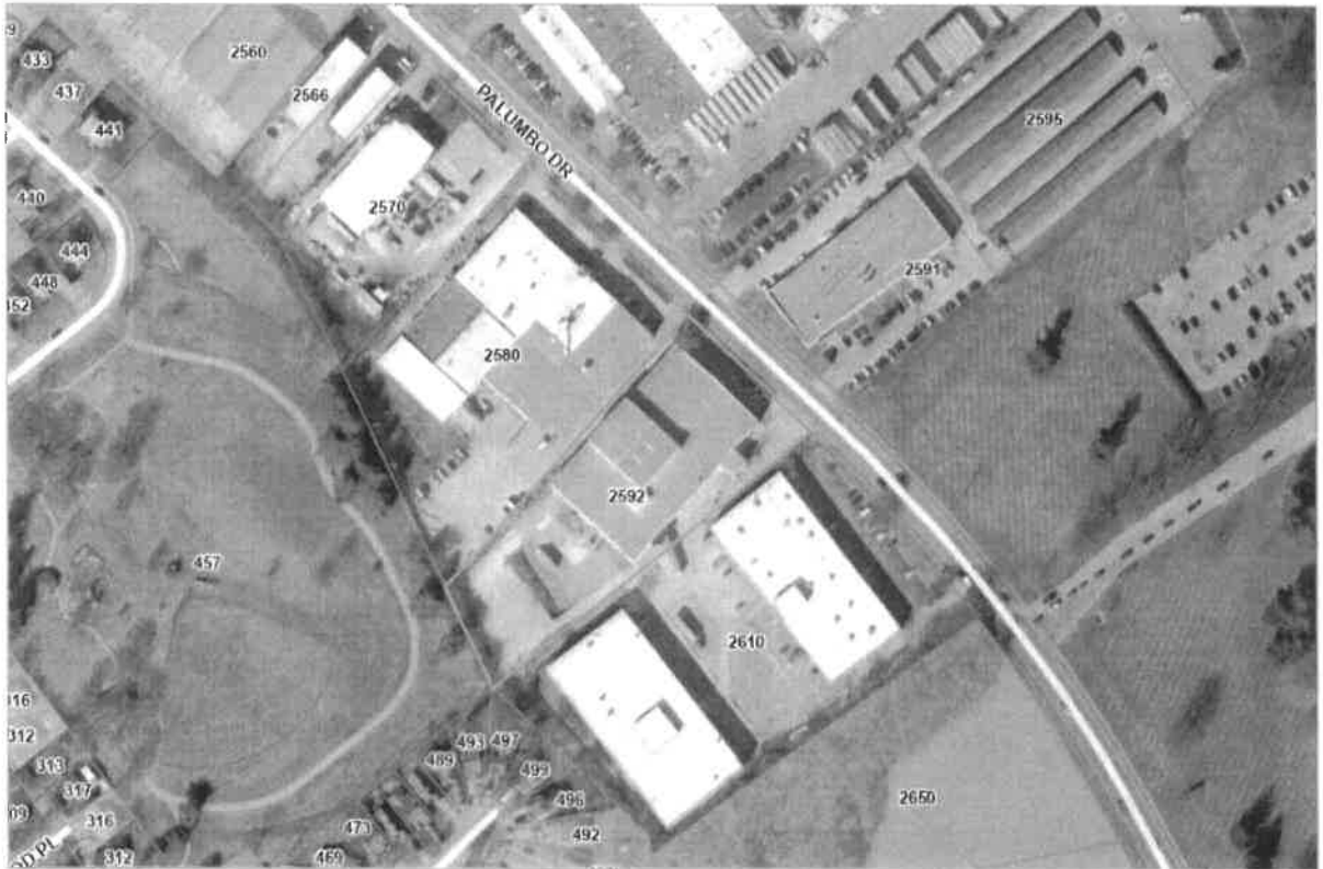
FIGURE 1 – MAP OF PROJECT AREA (FROM APPLICATION)