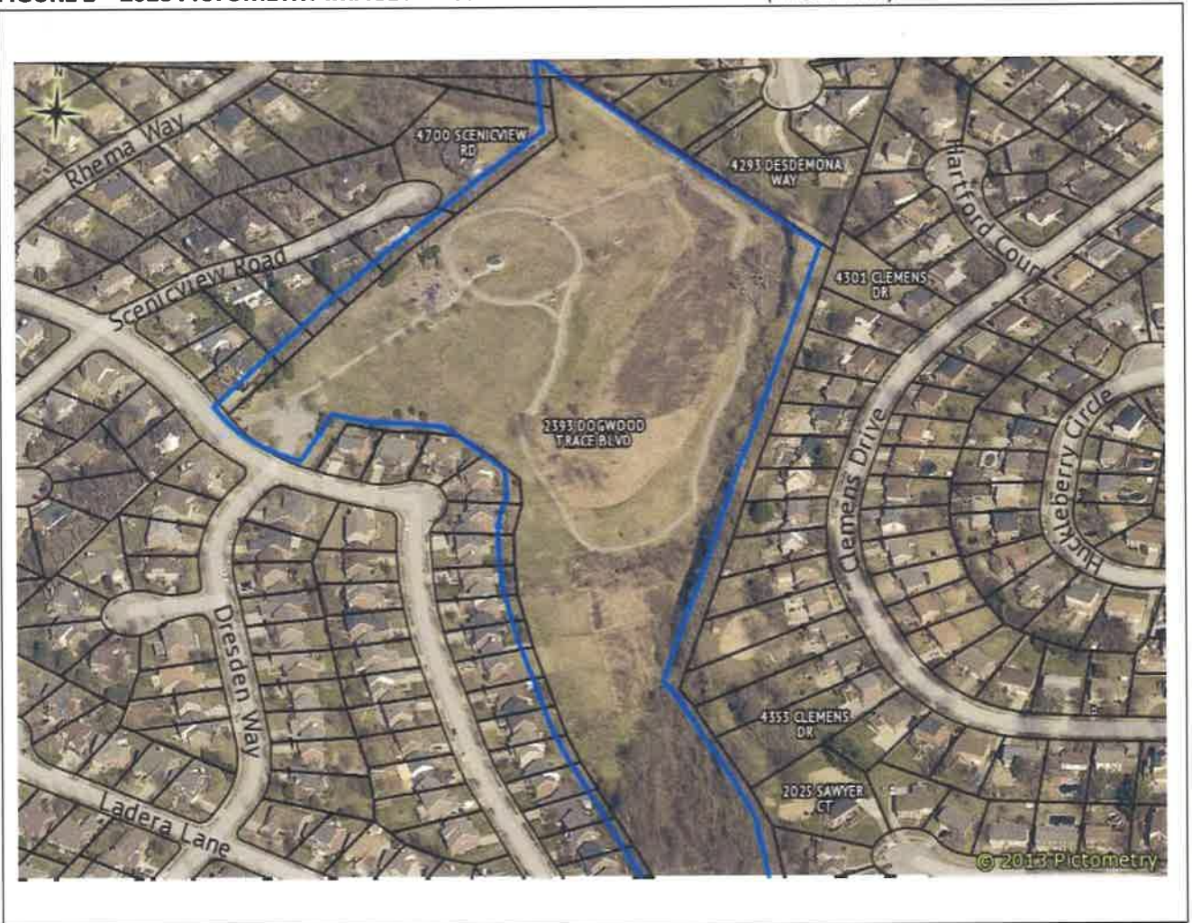
FIGURE 1 – 2018 PICTOMETRY IMAGE AT 2393 DOGWOOD TRACE BLVD (FROM PVA)