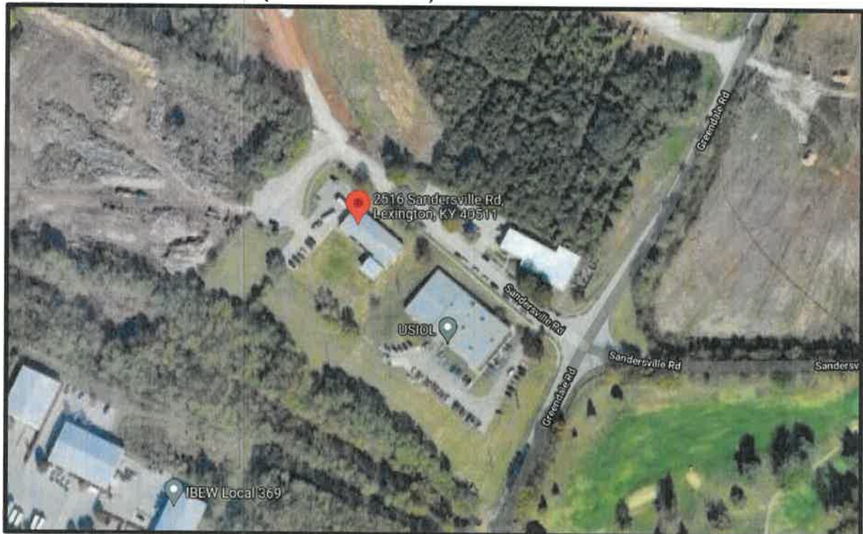
FIGURE 1 – MAP OF PROJECT AREA