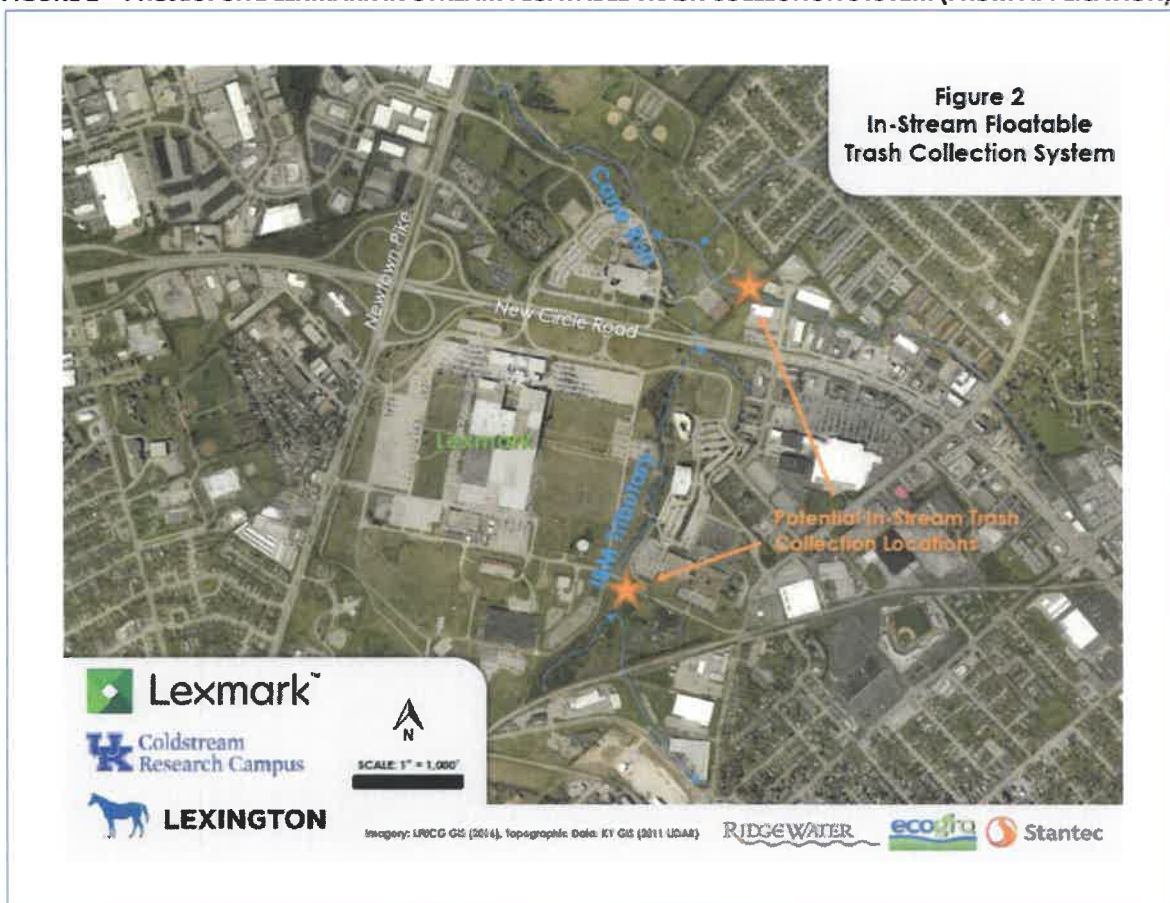
FIGURE 2 – PROJECT SITE LEXMARK IN-STREAM FLOATABLE TRASH COLLECTION SYSTEM (FROM APPLICATION)