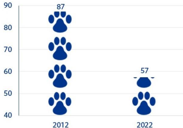
Adult dogs per facility

32,000 fewer dogs are caged in puppy mills!