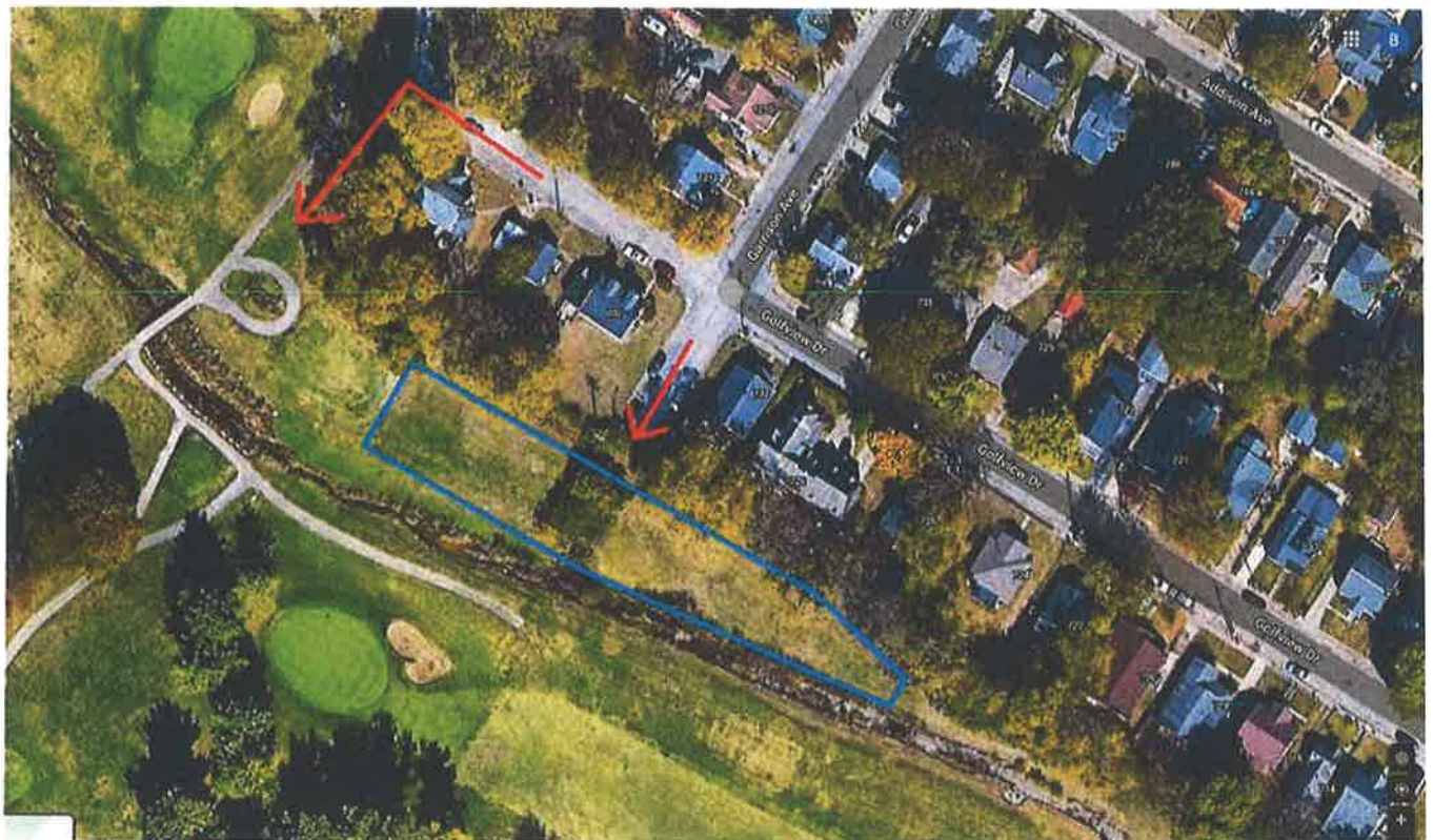
Figure S-2: Proposed Location of the constructed wetland and stream improvement at Picadoma Golf Course.