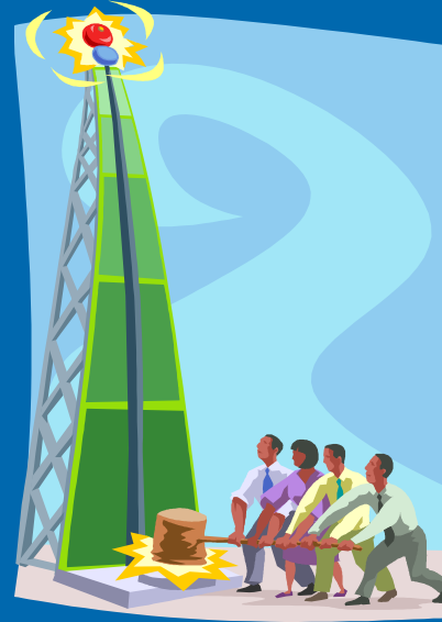
a Common Goal