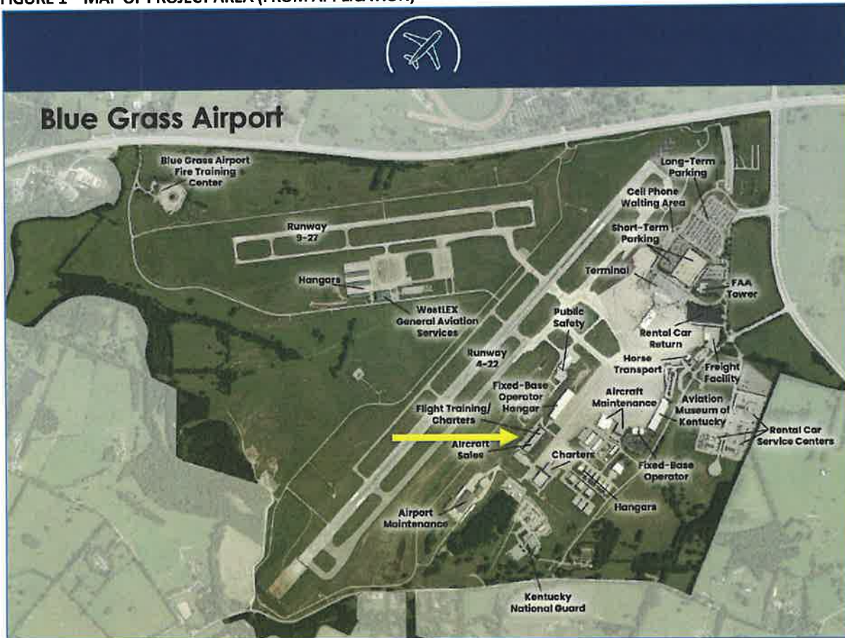
FIGURE 1 – MAP OF PROJECT AREA (FROM APPLICATION)