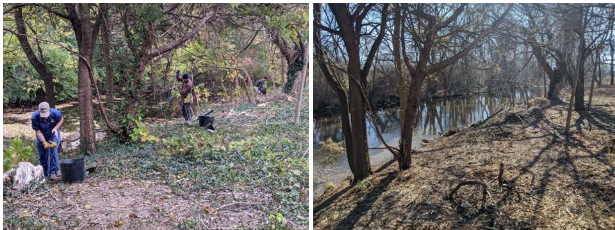
Fig 3. Before and After showing mechanical removal of invasive evergreen vines at Kilrush Food Forest.

Services Provided: Design and construction of a multifunctional riparian forest buffer including identification and removal of invasive species and community engagement in project design.