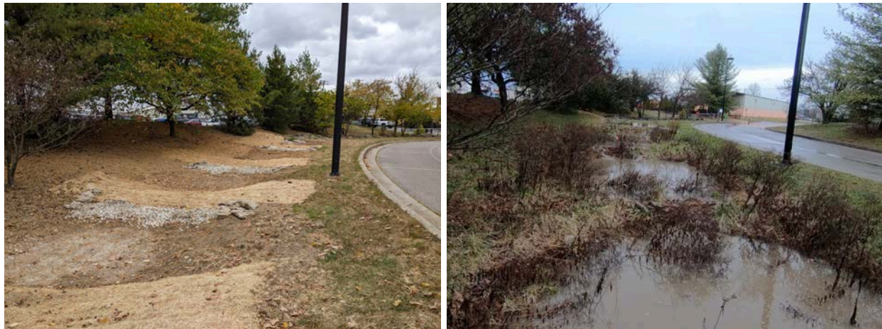
Fig 2. Nested rain gardens during construction and one year later during an active storm event.

Services Provided: Design and construction of an expanded rain garden system from Nature Center entrance to edge of park property.