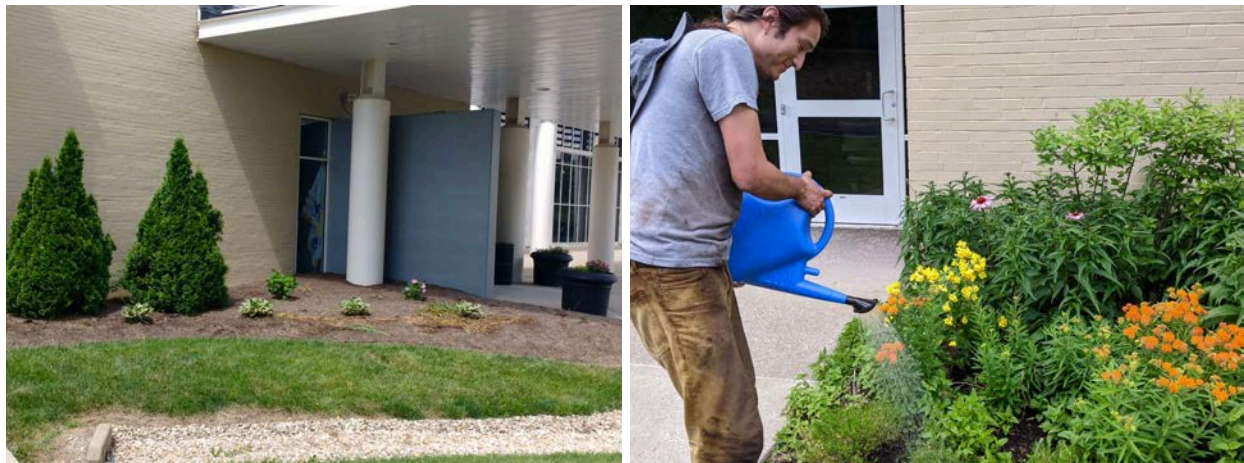
Fig 1. Before and After showing conversion of failed conventional landscape to pollinator habitat.