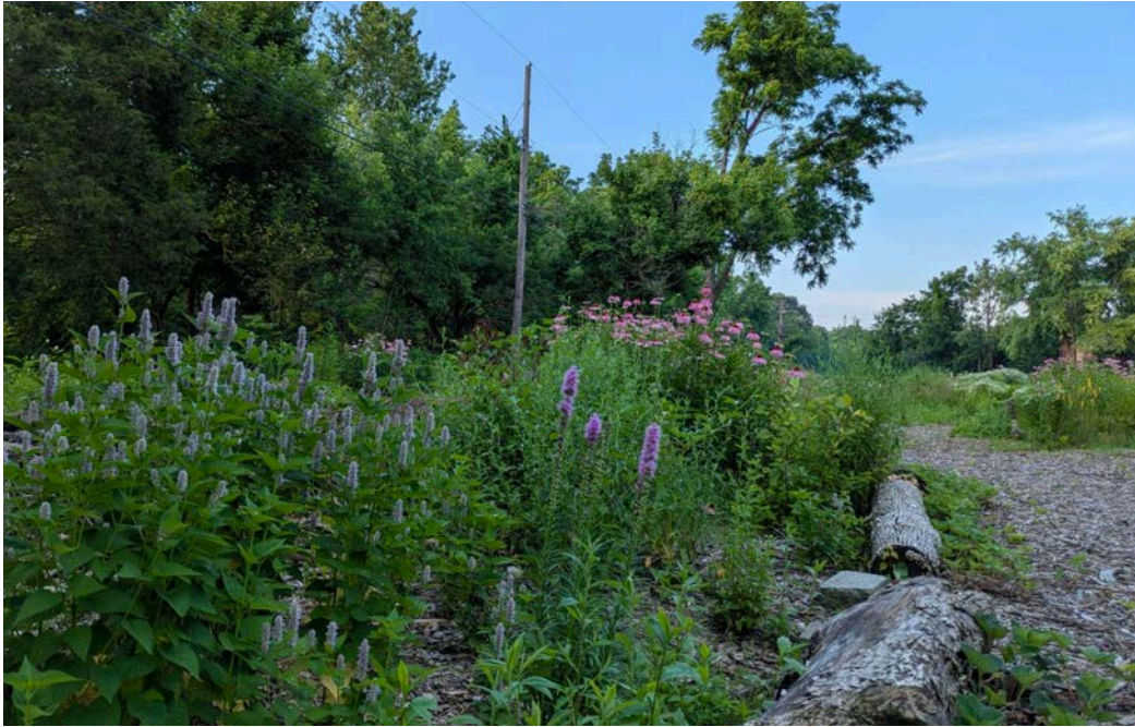
Fig 4. Kilrush Food Forest, June 2025

The kind of work we do at Geomancer may not always look like conventional greenways maintenance, and as a small company we are realistic about the kinds of contracts that would be appropriate for our expertise. But when it comes to the integration of agroforestry and social ecology with the development of greenways into urban infrastructure and neighborhood amenities, Geomancer is a leader in the field and stands ready to help strengthen Lexington.