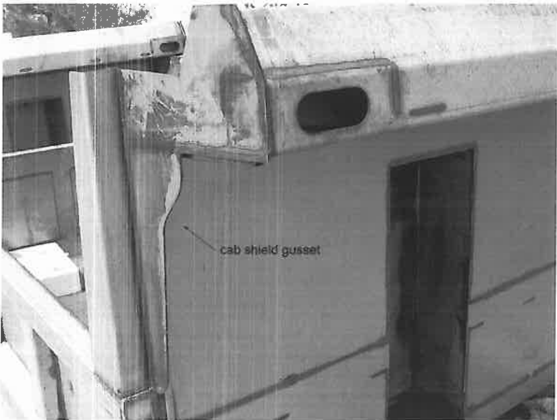
cab shield gusset