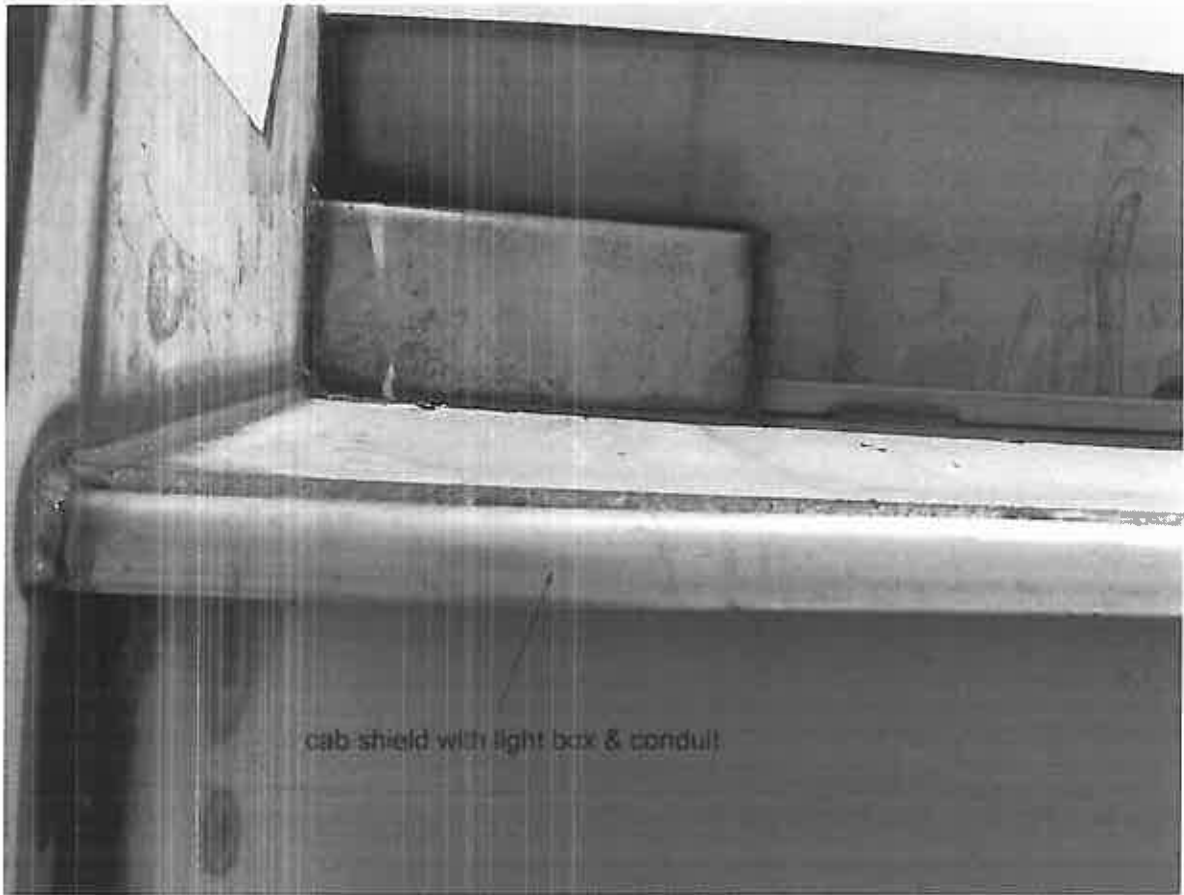
cab shield with light box & conduit