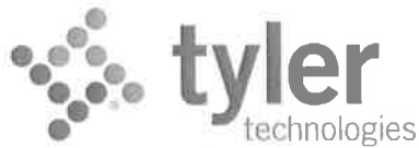
Exhibit 3 Discontinuance of Maintenance on Licensed Software