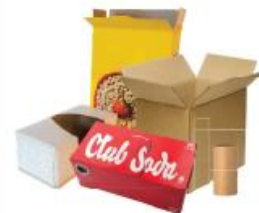
Dry Cardboard & Paperboard