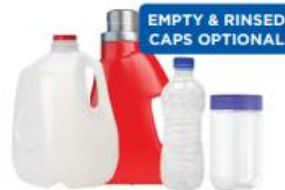
#1 and #2 Plastic Bottles, Jugs & Jars

Recycle ONLY these items in Central Kentucky.