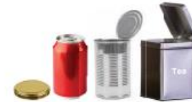
Steel & Aluminum Cans, Canisters and Lids