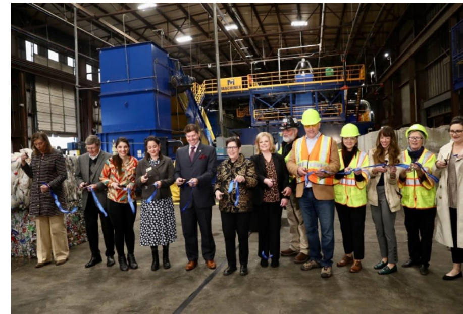
April 2022 Re-opening Event