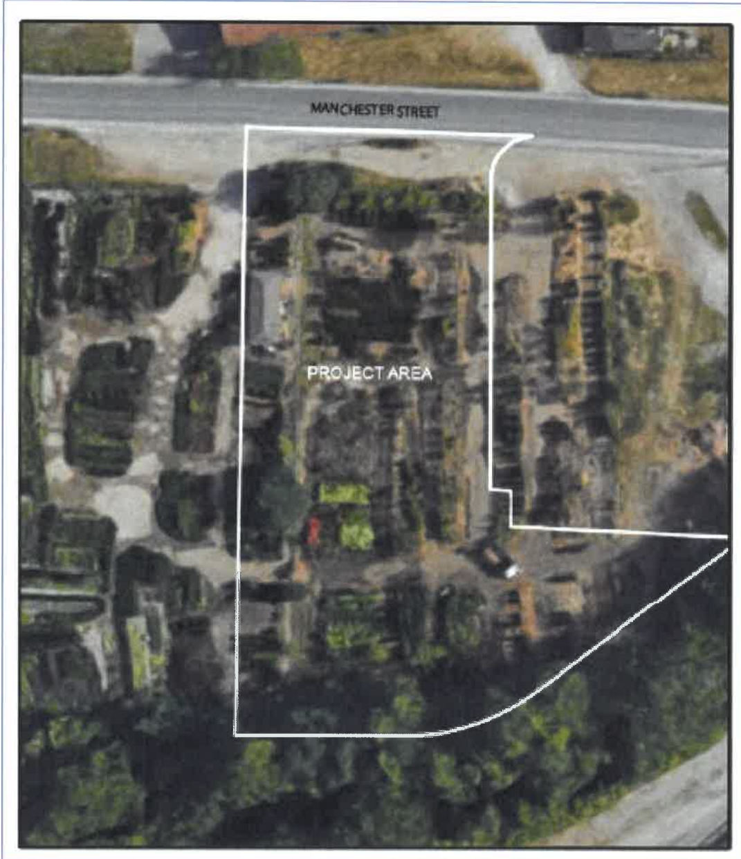
FIGURE 1 – PROJECT AREA (FROM APPLICATION)