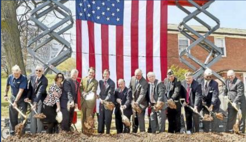
Groundbreaking Ceremony - Long Beach, CA