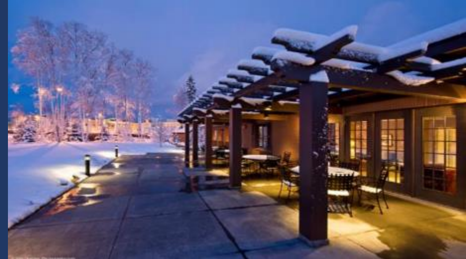
Joint Base Elmendorf-Richardson, Alaska

because A FAMILY'S LOVE is good medicine