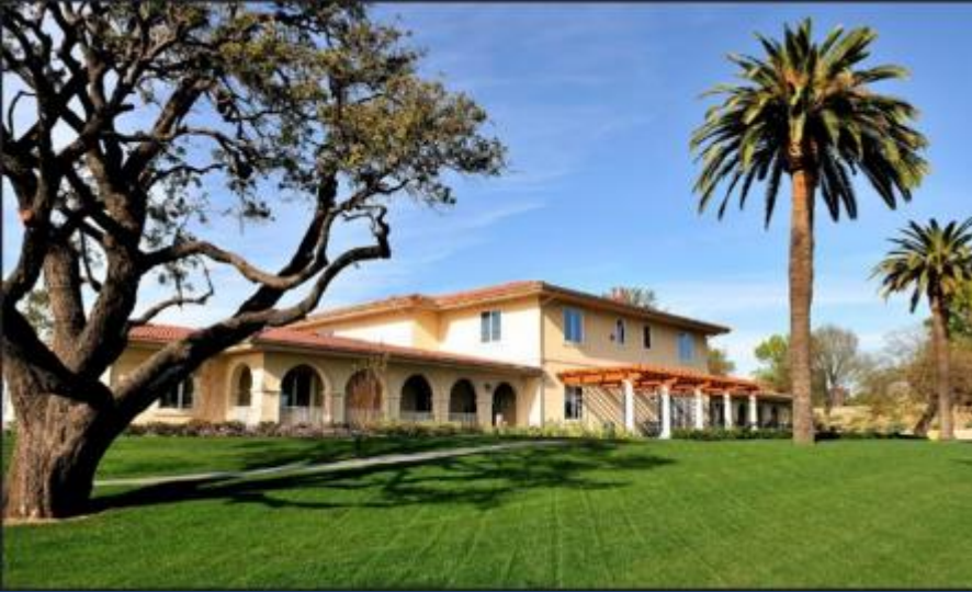
Los Angeles VAMC