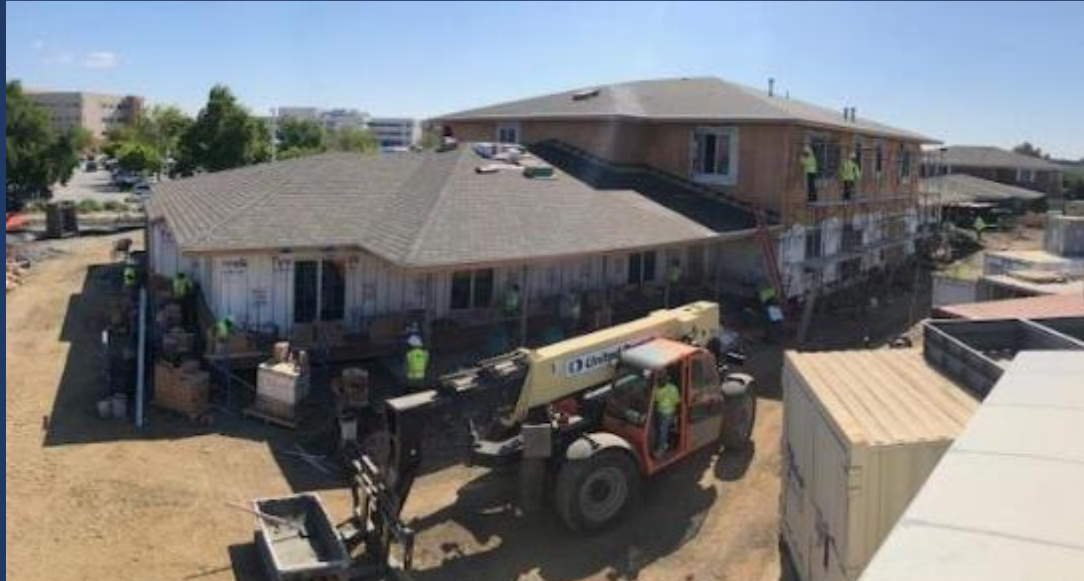
Second Fisher House at Palo Alto CA VAMC currently under construction.

Fisher House Foundation hires experienced private General Contractors.