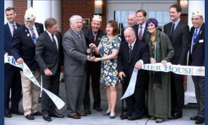
Dedication Ceremony - Charleston, SC

because A FAMILY'S LOVE is good medicine