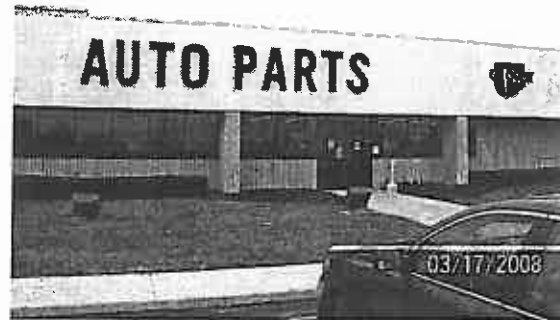
Store Contact Information for Store Key:1864 - DCS CQ OF LEXINGTON DC #7132