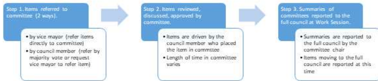
Figure 3. Required Business of Government Work Flow