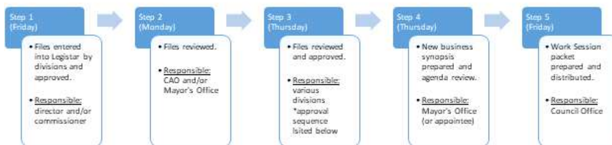
Figure 1. Administrative Work Flow