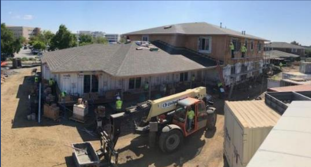
Second Fisher House at Palo Alto CA VAMC currently under construction.

Fisher House Foundation hires experienced private General Contractors.