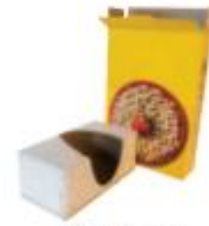
Paperboard (Not packaging for frozen and refrigerated goods)