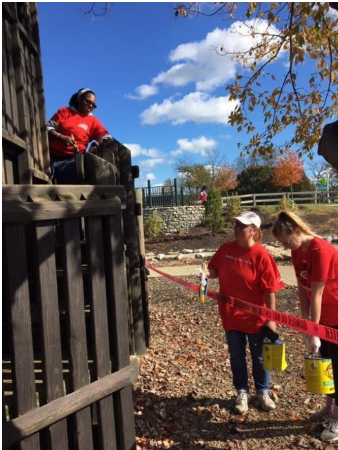
Staining the wooden structure