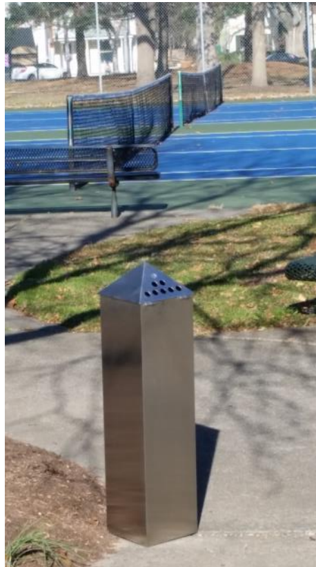
Stainless Steel Ground Mounted