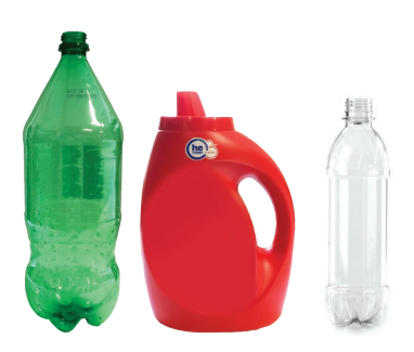
Plastic screwtop bottles and jugs

Recycling is local. Lexington accepts the following: