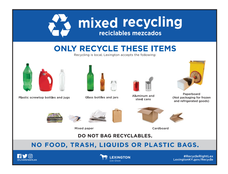
Office bin label