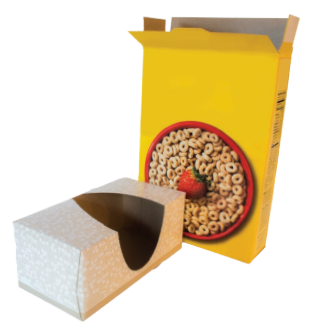
Paperboard (Not packaging for refrigerated/frozen goods)