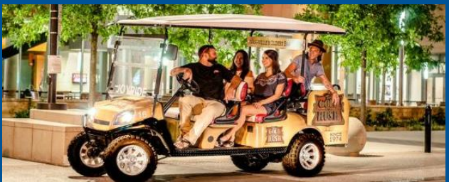
Joyride (Knoxville, Panama City, Nashville, Tuscaloosa, Tallahassee)