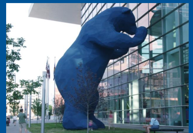
I See What You Mean (Denver, CO)