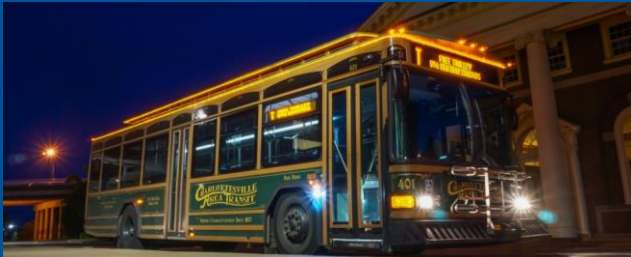
Free Trolley (Charlottesville, VA)