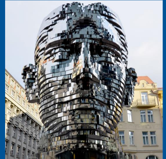
Head of Franz Kafka (Prague, Czech Republic)